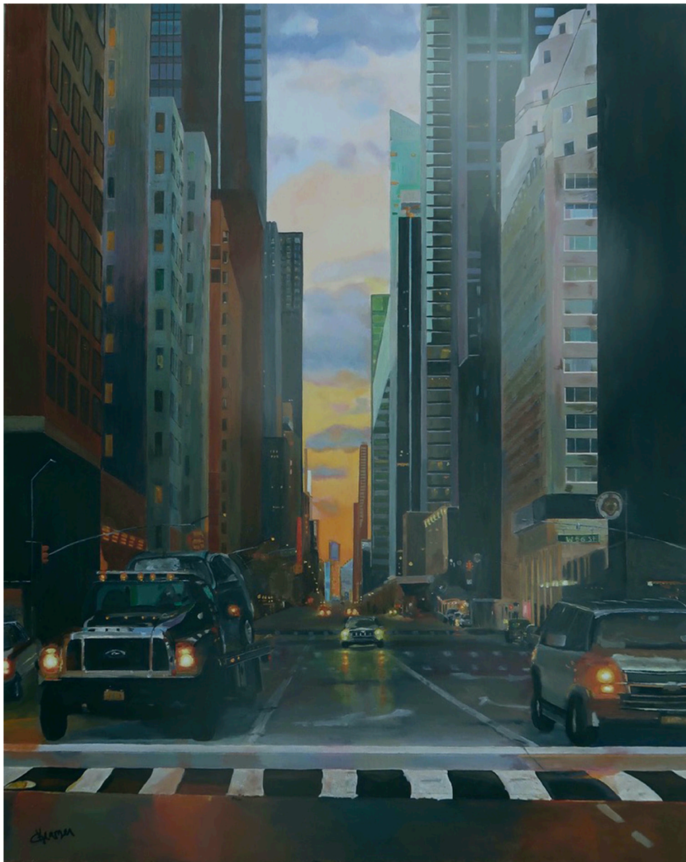
SECOND PLACE Cheryl Kramer Sun Sets on Mountains of NYC Oil