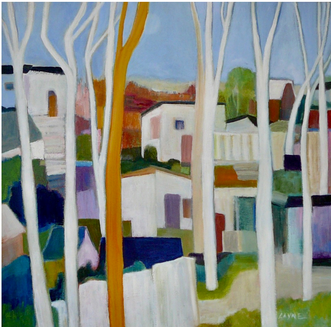
PAINTING AWARD Layne Standing Tall in Saffron Oil