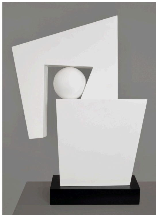
SCULPTURE AWARD Robert Meyer 2 Forms w/ Sphere No. 10 Steel, Aluminum